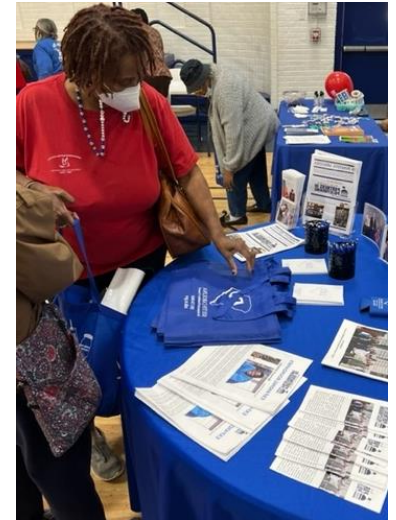
Seniors receive information