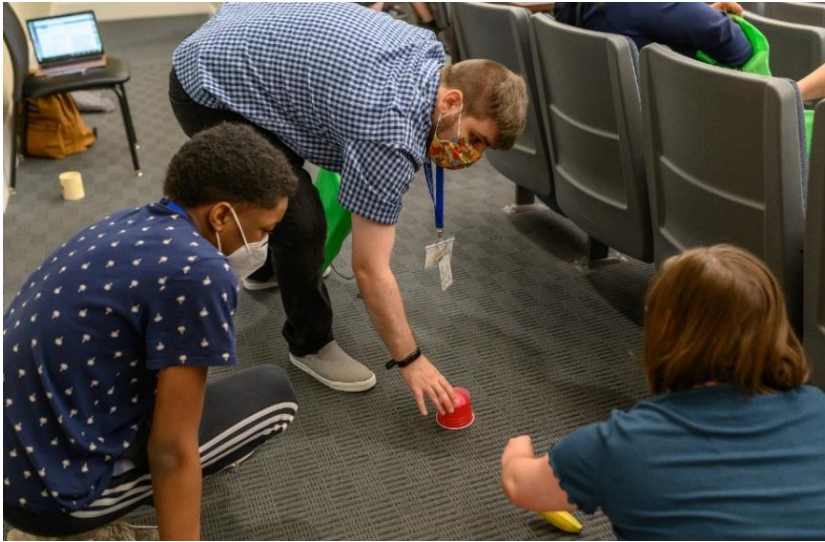
Participants take part in team building exercises to strengthen socialization skills