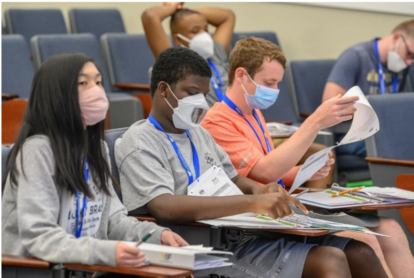
The Purple Elephant Group” is working on individual goal setting.