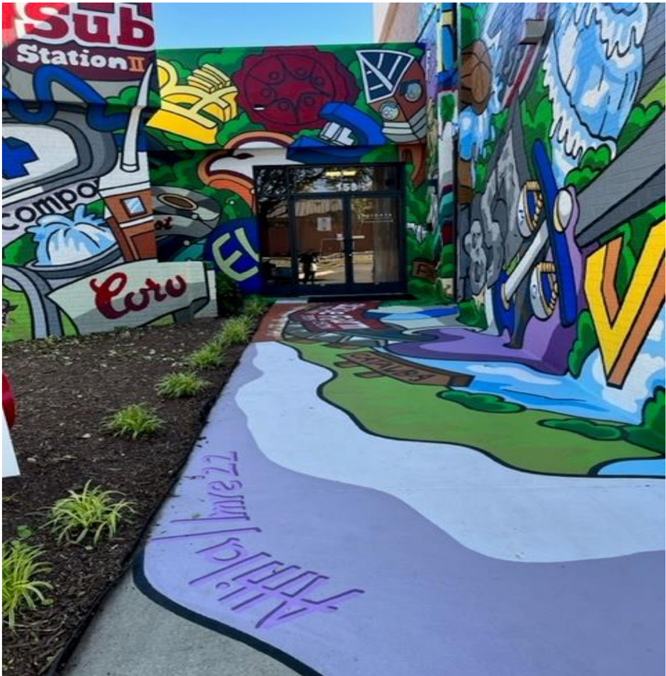
Cover Photo: Gravity Center, Rock Hill York Can Inclusion Project

MISSION: The mission of the South Carolina Developmental Disabilities Council is to provide leadership in planning, funding, and implementing initiatives that lead to improved quality of life for people with developmental disabilities and their families through advocacy, capacity building, and systemic change.