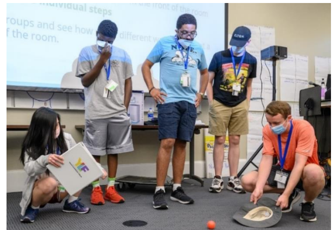
Break out activities consisted of participants engaging in exercise, team building, one-on-one goal setting, influencing systems, dance collaboration, advocacy, and fun!