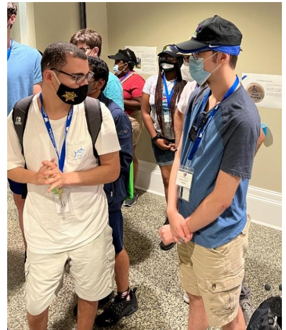
Participants are getting ready for the next session.